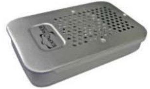
KIN.0481 - SILICA BOX