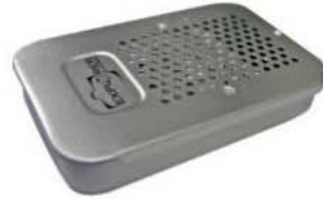
KIN.0481 - SILICA BOX