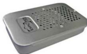
KIN.0481 - SILICA BOX